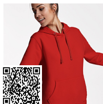
URBAN WOMAN SU1068