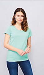
SOL'S MIA 01699